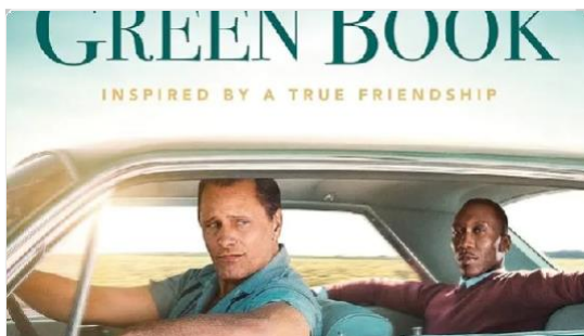
September 18th - Green Book (2018)