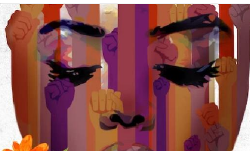
October 16th - Stamped from the Beginning (2023)